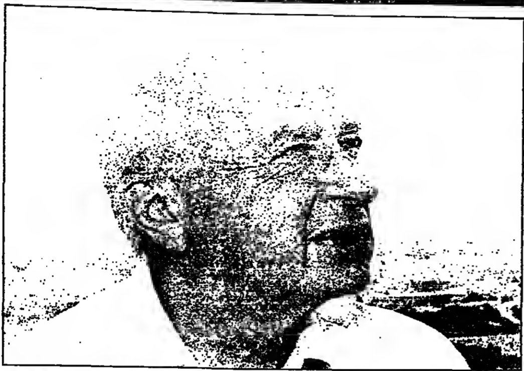
A year after his assassination, Yitzhak Rabin is the subject of many TV and radio programs.